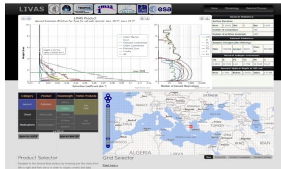
Figure 1. The LIVAS web-portal.